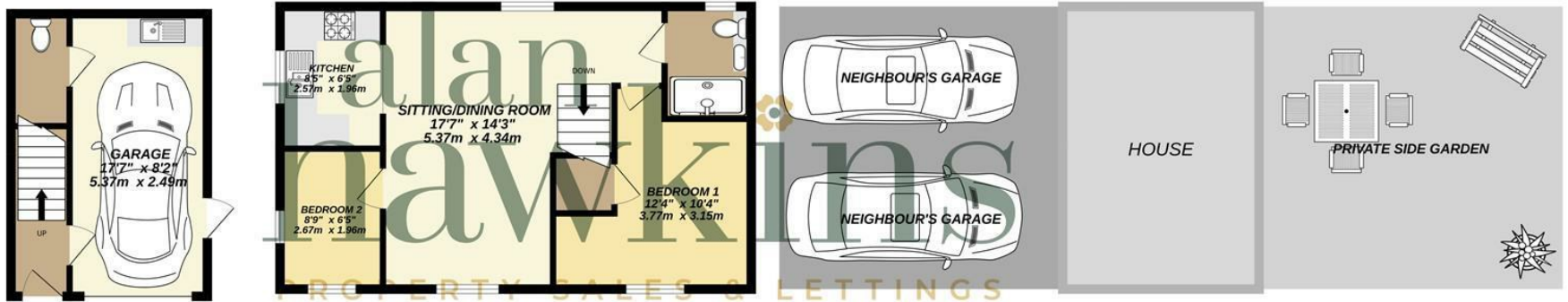
TOTAL FLOOR AREA : 735 sq.ft. (68.3 sq.m.) approx.

Whilst every attempt has been made to ensure the accuracy of the floorplan contained here, measurements of doors, windows, rooms and any other items are approximate and no responsibility is taken for any error, omission or mis-statement. This plan is for illustrative purposes only and should be used as such by any prospective purchaser. The services, systems and appliances shown have not been tested and no guarantee as to their operability or efficiency can be given. Made with Metropix ©2025